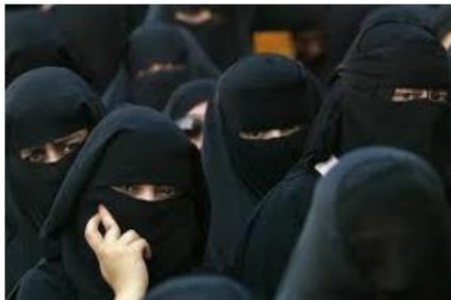
Women in Saudi Arabia do not have the right to vote